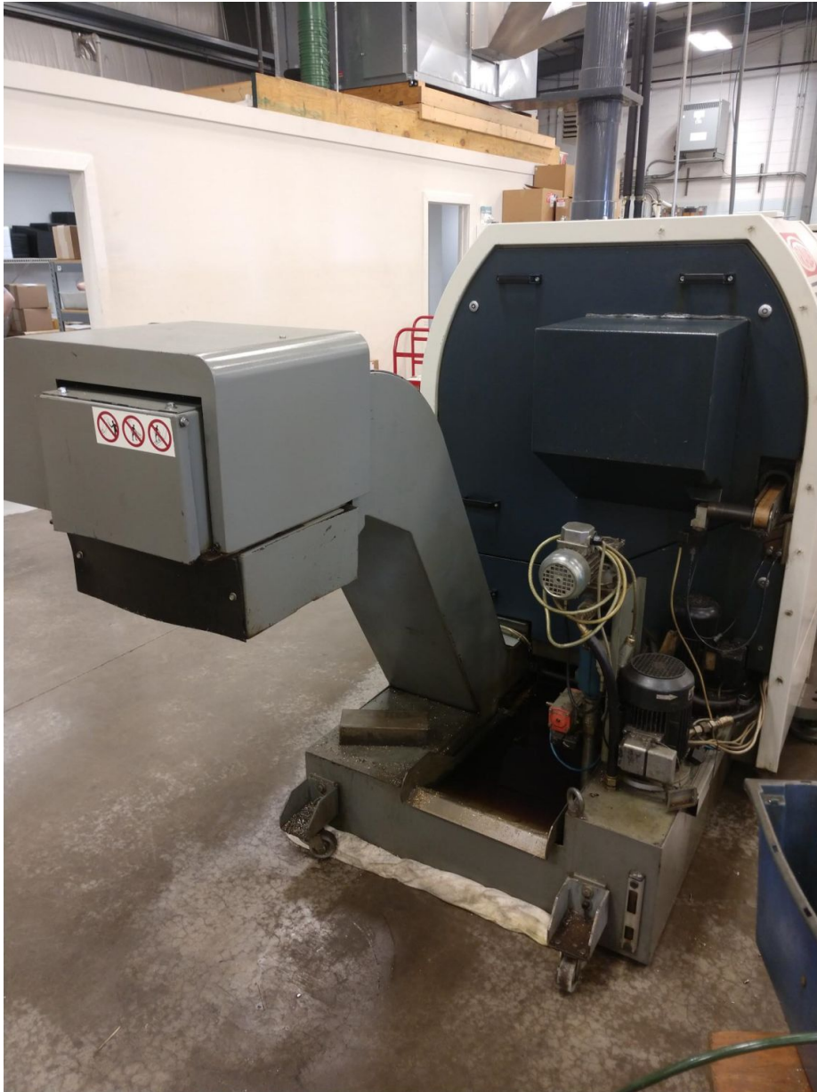
Knoll Chip Conveyor S/N 200012971 for TNL26 S/N 160