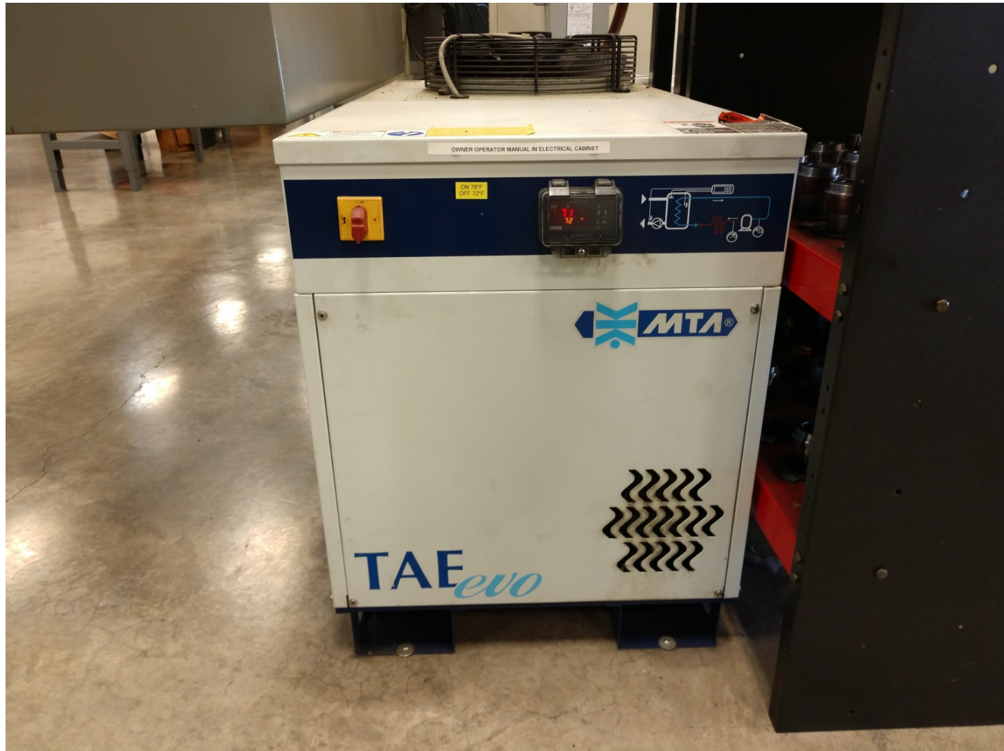
Chiller unit for TNL26 S/N 167